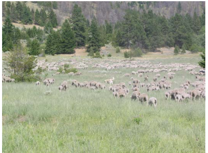
Sheep are being used on an experimental basis on the Maddox Ranch for knapweed management.