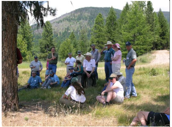
The group listens to discussion on the merits of community efforts to jointly manage the Blackfoot River watershed.