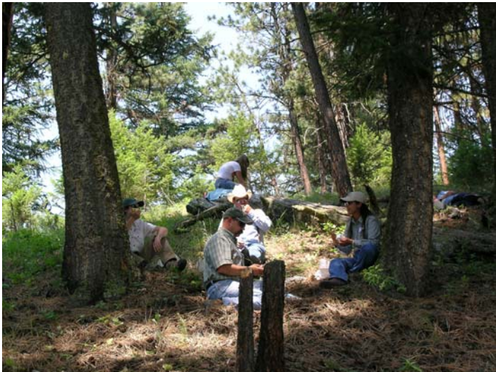
A Ponderosa Pine hillside makes a great stop for lunch